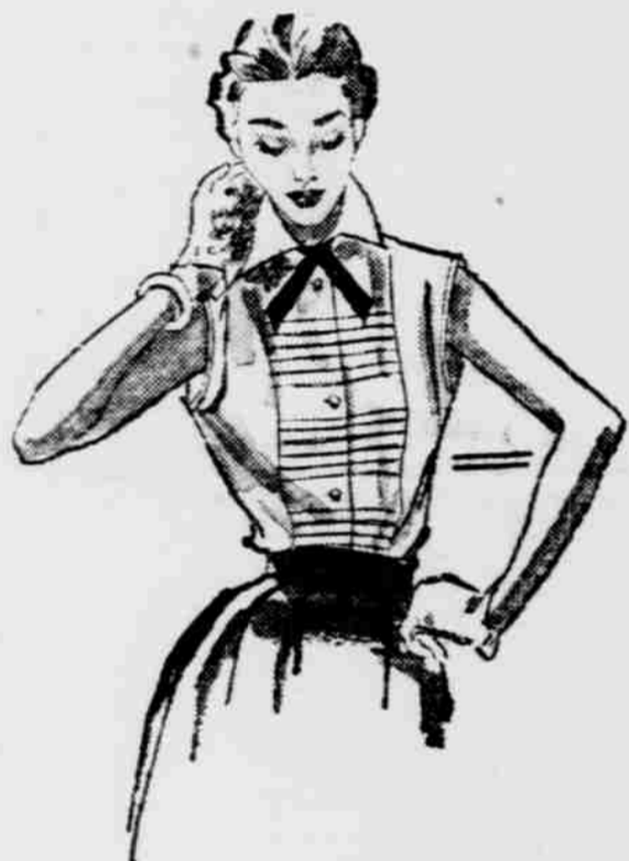
Above . . . Here's Blousemaker's bare armed charmer for spring in fine, combed cotton pique. Set off with a pert little black bow that merely buttons on, this blouse will be your favorite. White only, 32 to 38. 4.95.

When you buy your Easter blouse, be sure to see the superb new Blousemakers at Soennichsens! Famous from coast to coast for fashion, fit and washability, Blousemaker is a marvelous addition to Soennichsens's long list of famous names of fashion. Blousemaker blouses fairly sparkle with style . . . and they're ever-so-beautifully made! See Blousemaker blouses at Soennichsens's today!