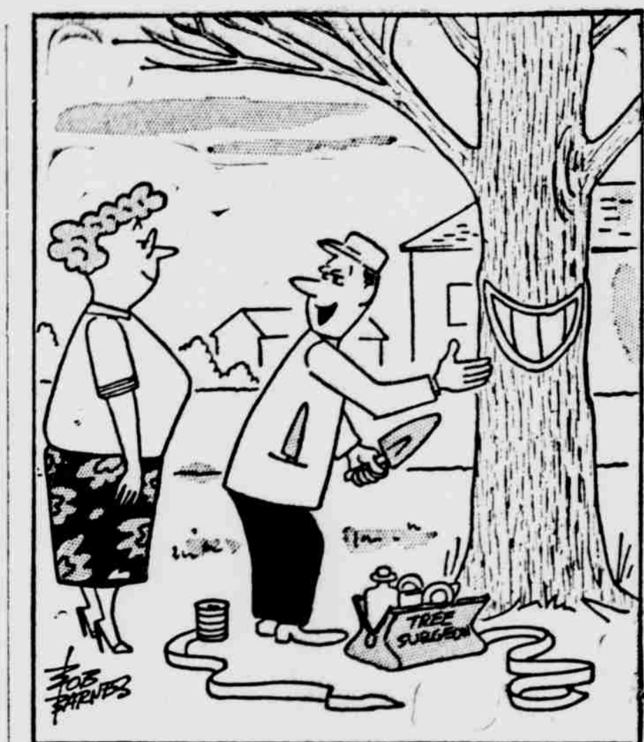
"See!—it's feeling better, already!"

CECIL KARR — ACCOUNTING — Income Tax Service Bookkeeping Systems Installed Ph. 6287 Donat Building