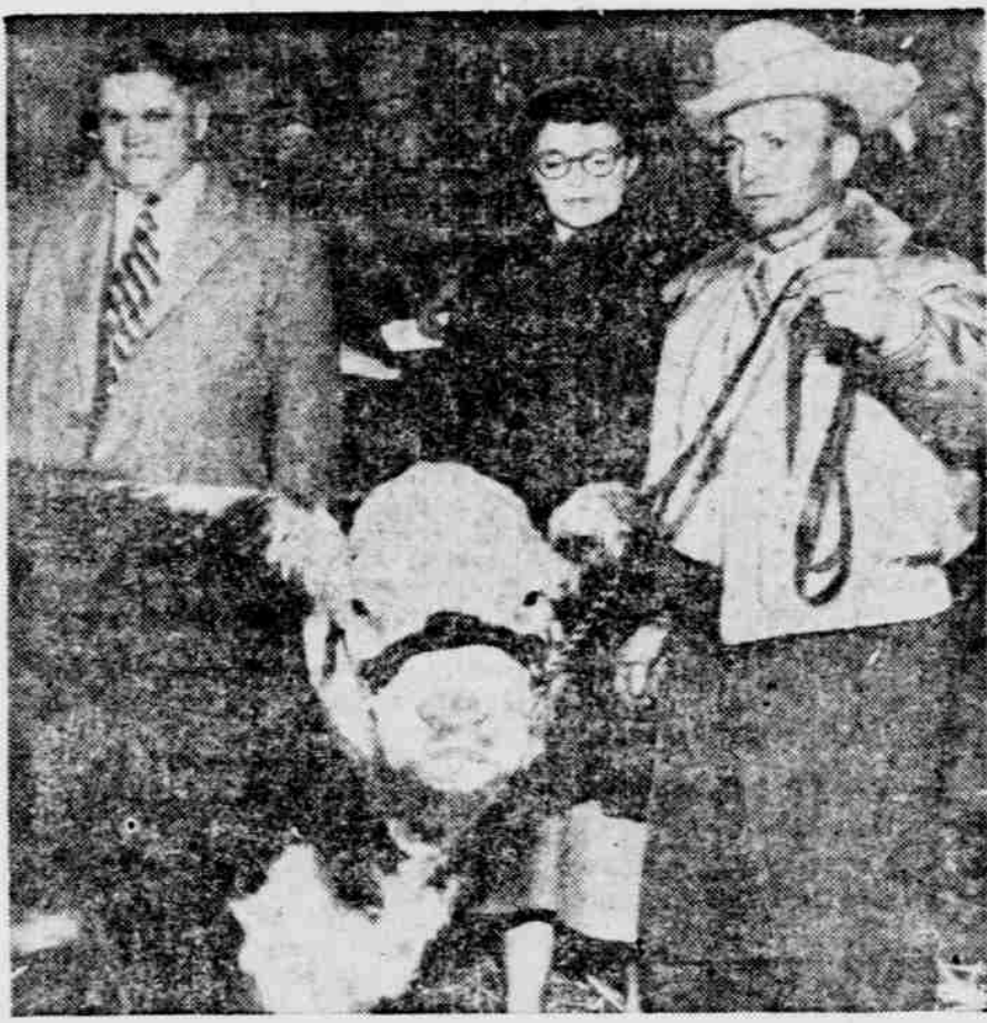
RECORD HEREFORD . . . In Denver, Dandy Domino 1, grand champ female at national western polled hereford show, sold for $12,000, new record for the class.