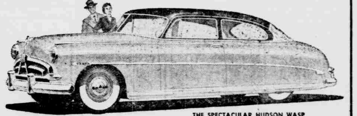
THE SPECTACULAR HUDSON WASP Only new car of the year!

Standard trim and other specifications and accessories subject to change without notice.