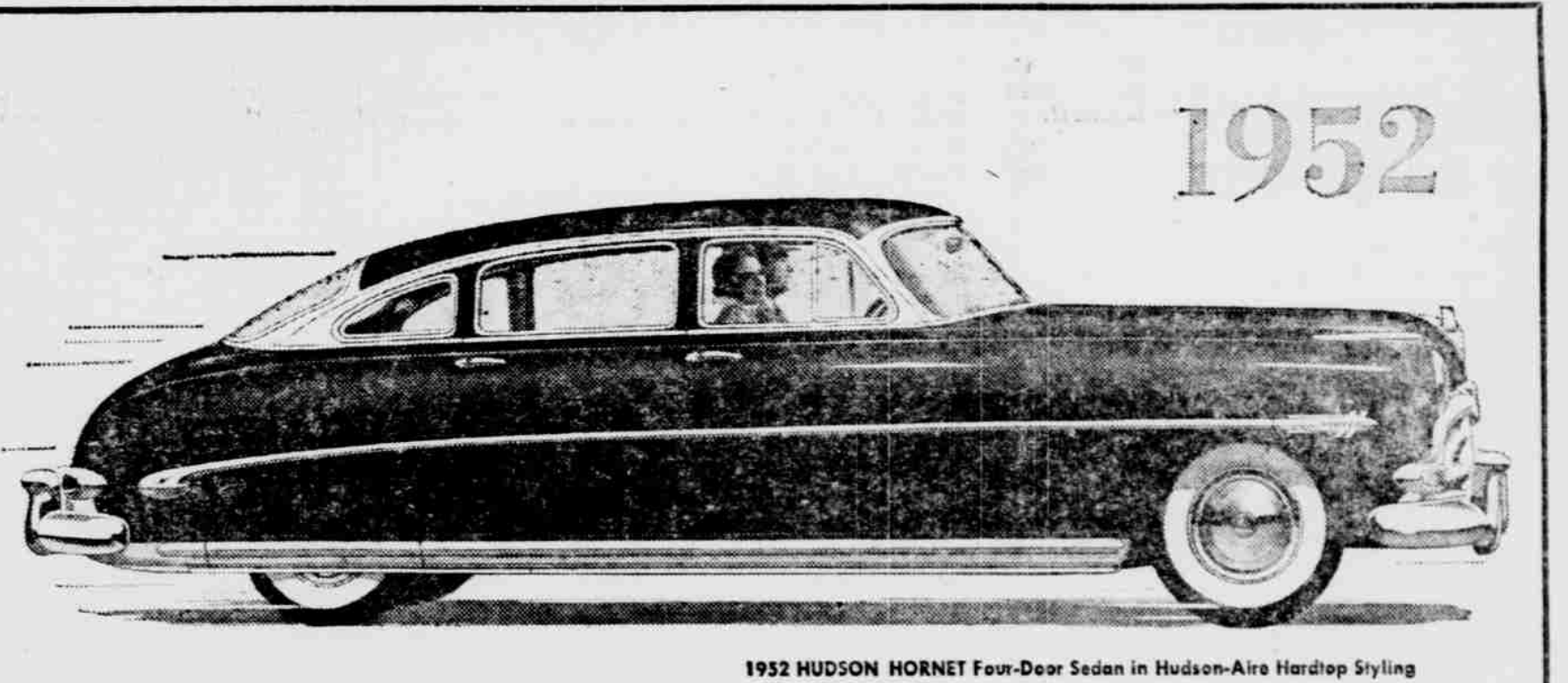
1952 HUDSON HORNET Four-Door Sedan in Hudson-Aire Hardtop Styling