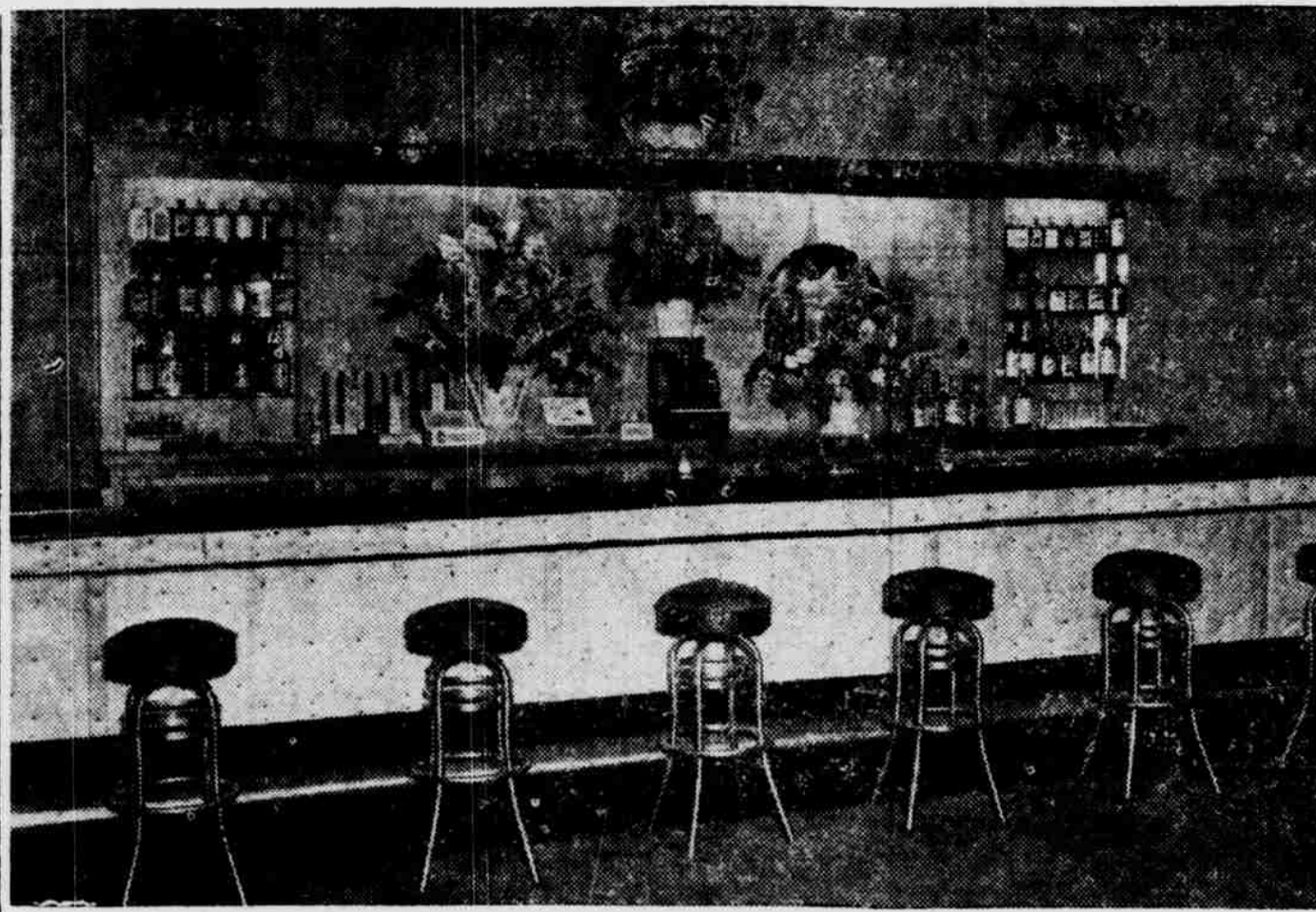
For refreshments, Eagles point with pride to their new remodeled cocktail lounge. Shown is the new bar and the built in back bar, two of the improvements made during the recent remodeling. Flowers were gifts of well-wishers and members during the open house held in March.