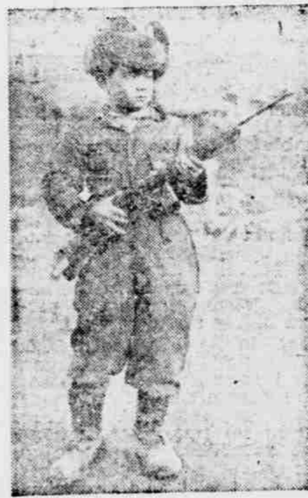
YOUNG SOLDIER . . . They begin fighting for their country at a tender age in Korea. This youngster is ready for a man's job.