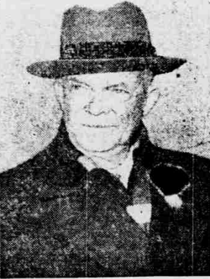
DEFENSE COMMANDER Gen. Dwight Eisenhower assumes grave countenance after appointment as commander-in-chief of Europe's army.