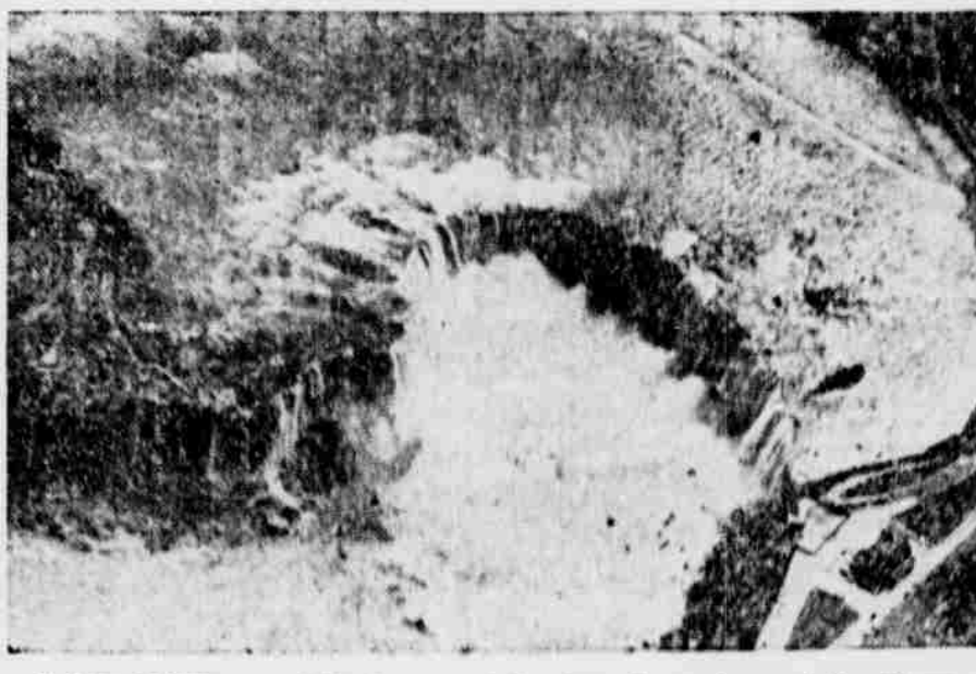
RARE VIEW . . . This is one of the few clear views of the Horseshoe Cataract (Canadian) at Niagara Falls, which is usually obliterated by fog.

Rats consume, destroy and Every 4-H club member in Cass duals fication contest at the Ak-Sar- need to be enrolled in a 4-H poul-Ben Poultry Congress on Friday, try project November 30. The contest begins at 9:30 at the Omaha City Au-