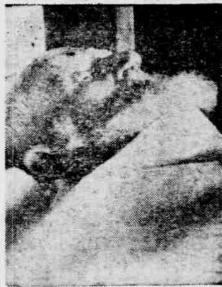
LYING IN STATE . . . Body of playwright George Bernard Shaw lies in bedroom of his Ayot, St. Lawrence, home.

Second Floor Plattsmouth State Bank Bldg. Phone 6111