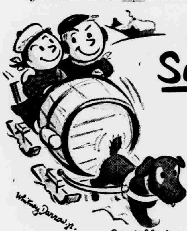
Barrel of fun!