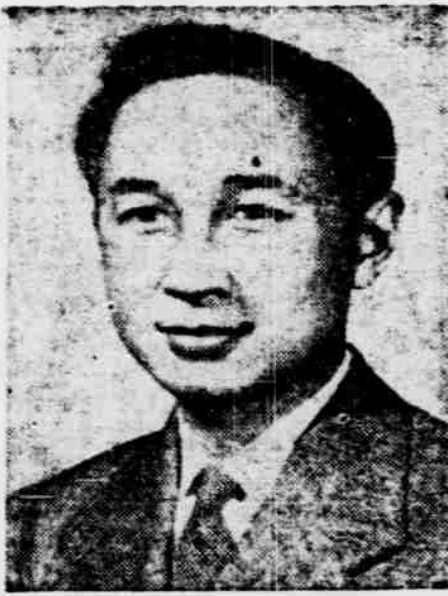
AIDING REDS? ... Customs officials seized eight cases of technical data which California Tech rocket expert, Prof. Hsue Shen Tsien, attempted to ship to Shanghai in K. C. China.