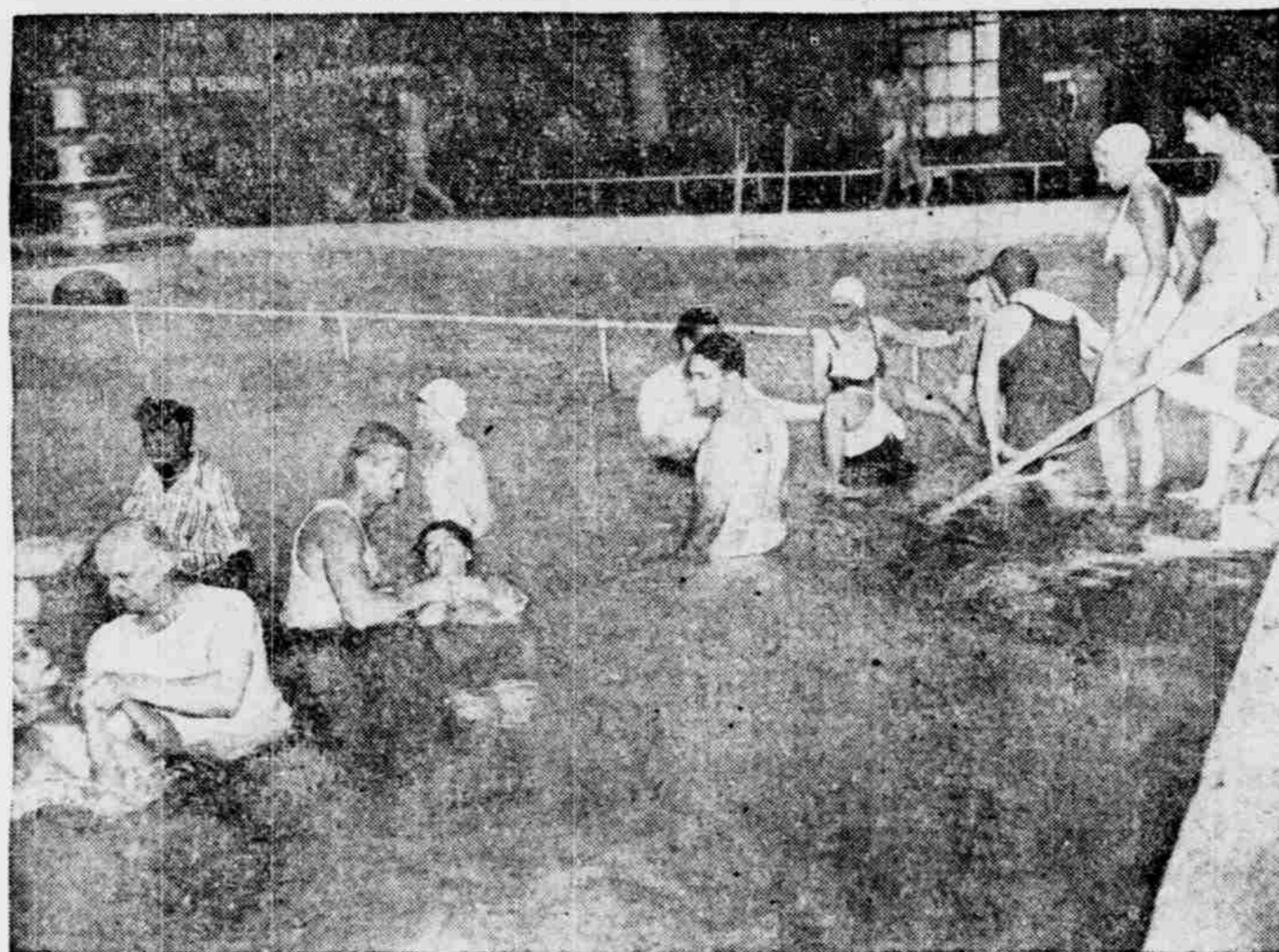
BAPTISM RITES . . . Some 2,000 members of Jehovah's Witnesses were baptized in one day in a New York City swimming pool as part of services attended by more than 80,000 in convention in Yankee Stadium. It was one of the largest religious gatherings in the history of the nation.

FIRM GAS SERVICE RATE Availability—This rate is available only to domestic and commercial customers whose maximum requirement is less than 1,000 cubic feet per hour. The gas service company shall not be required to serve any customers at the following maximum rate whose requirements amount to 1,000 cubic feet or more per hour. "Except that any customer receiving 'Firm