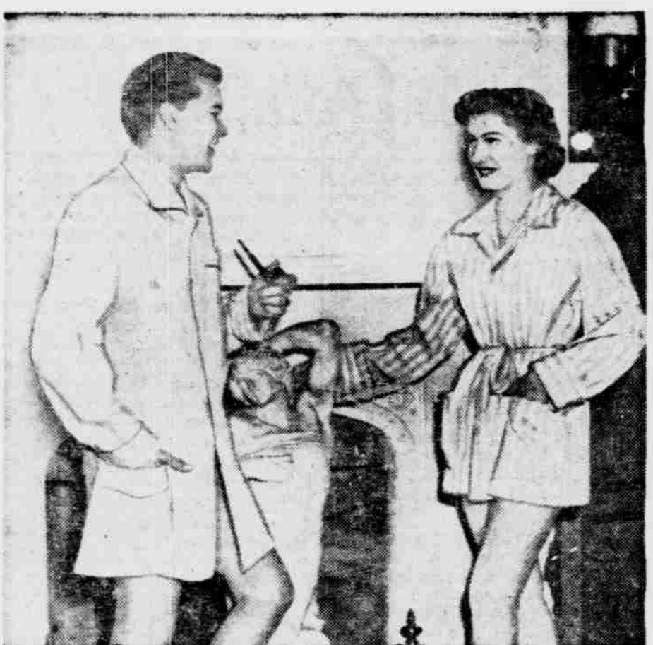
FOR ANTI-PANTS SLEEPERS . . . Because, he claims, 60 per cent of pajama wearers never use the pants, a Paris haberdasher has come up with extra-long pajama coats for man and wife. There is also a fingertip nightgown for men. Women, says the Parisian, love them because there are no pants to wash. The pantsless sleepers are selling like hot cakes at $5 a copy.