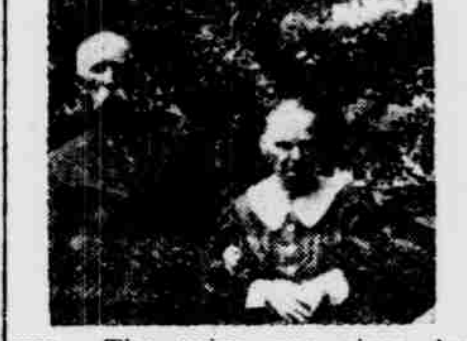
The prize was given by the National Father's Day Committee.