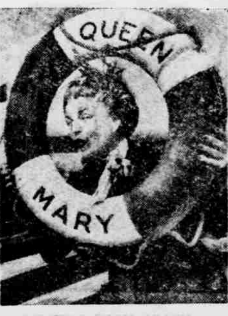
GREETING FROM GRACIE ... This is not Queen Mary, but Gracie Fields, coming a-whistling in on the big steamer, Queen Mary, from England.