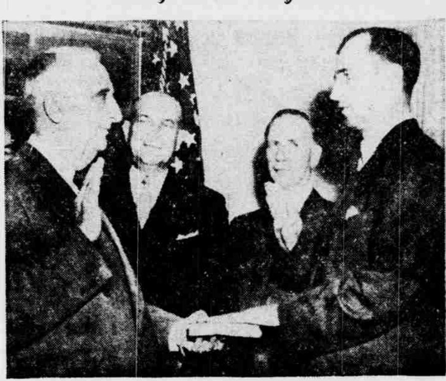
WASHINGTON, D. C.—Frank Pace, Jr., ex-budget director, was sworn in as army secretary by Chief Justice Fred Vinson. Left to right: Vinson, Defense Secretary Louis Johnson; Retiring Army Secretary Gordon Gray, and Pace.