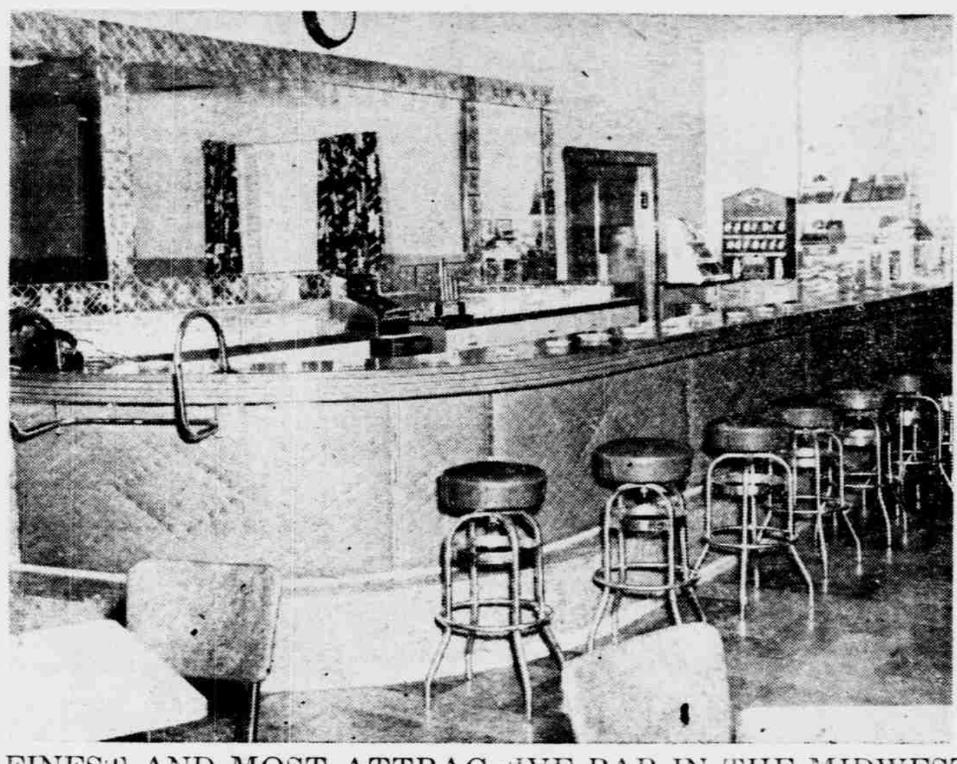
FINEST AND MOST ATTRACTIVE BAR IN THE MIDWEST

Bar in the new 40 & 8 club is one of the most attractive in the midwest. Upholstered in tufted green Duren, the bar is backed by a 4x18 foot plate mirror framed in panels of cut glass. Redtopped chrome stools line the front of the bar.