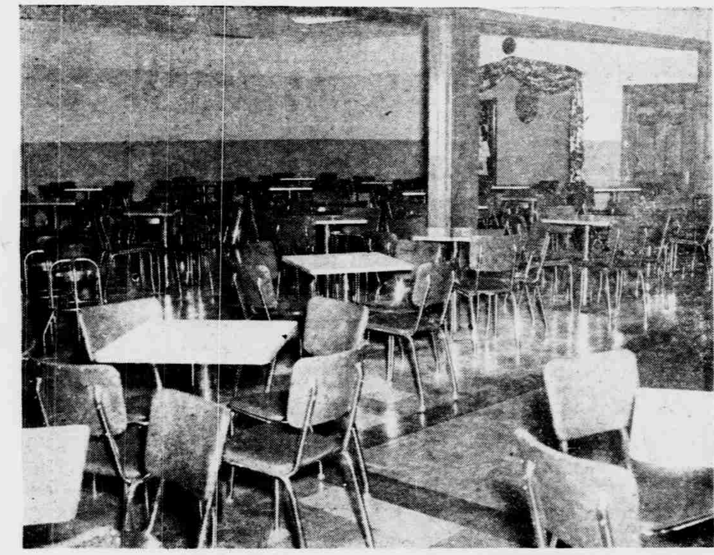
DINING AREA WILL ACCOMMODATE 150 GUESTS

Bar in the new 40 & 8 club is one of the most attractive in the midwest. Upholstered in tufted green Duren, the bar is backed by a 4x18 foot plate mirror framed in panels of cut glass. Redtopped chrome stools line the front of the bar.