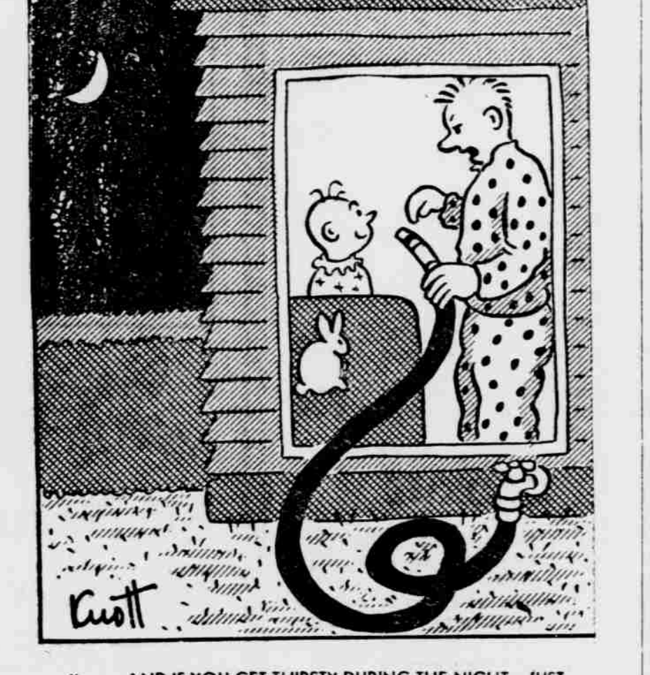
"... AND IF YOU GET THIRSTY DURING THE NIGHT, JUST TURN THIS."