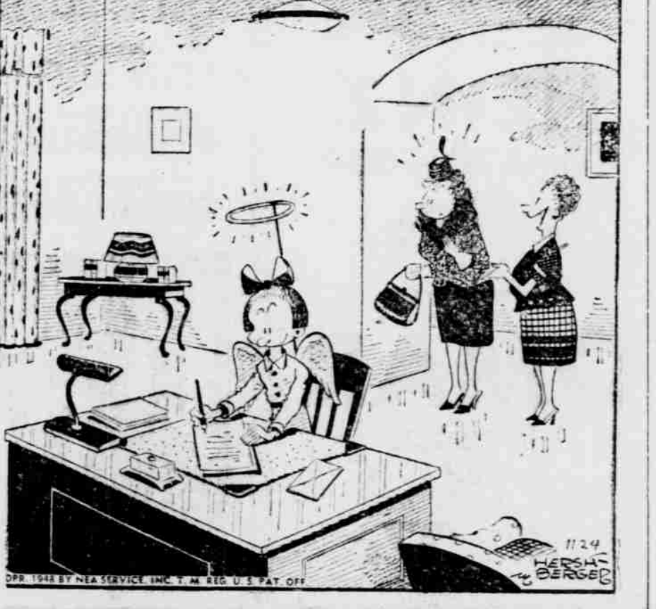
"It's the get-up she uses to write to Santa Claus!"