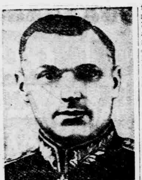
DRAFTED . . . Marshall Konstantin K. Rokossovsky, one of Russia's top wartime commanders, was drafted by the Polish government to work with Poland's Red army. He will reorganize Poland's army to fit the Soviet pattern.