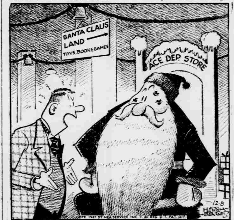
"But you're only supposed to hold children on your lap!"