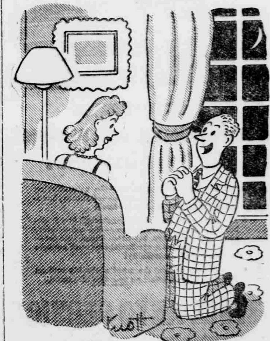
"DARLING... YOUR DAD IS PRESIDENT OF BAXTER OIL, INC., ISN'T HE?... WILL YOU MARRY ME?"