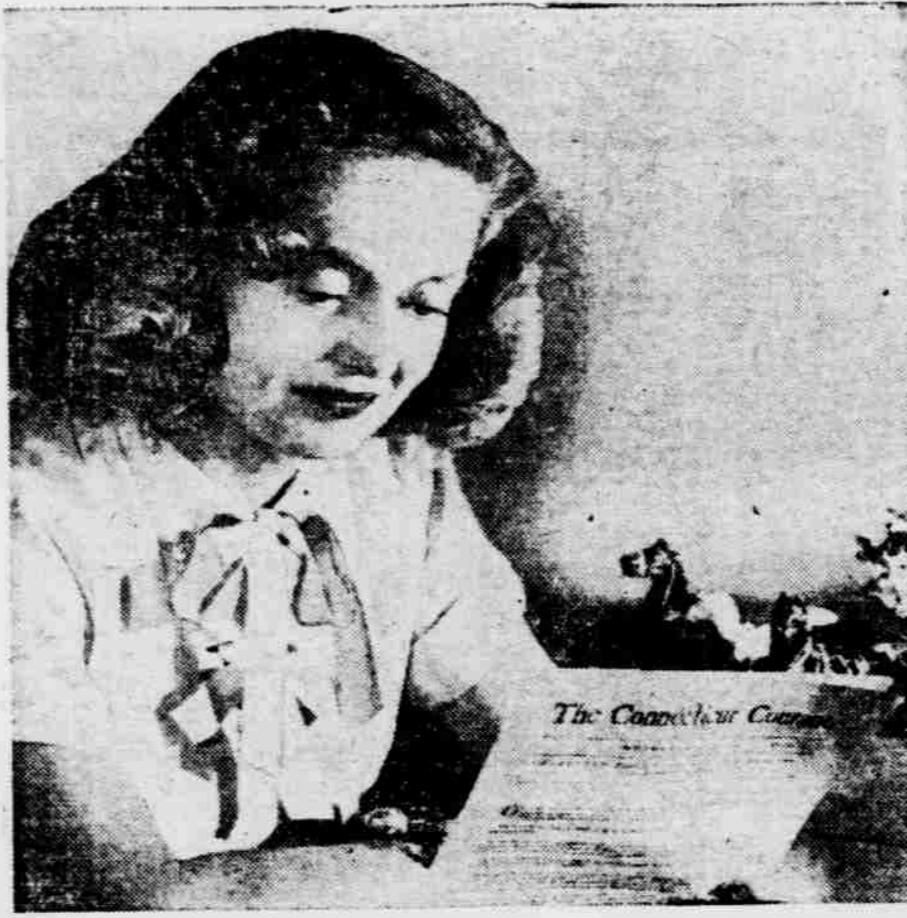
CATCHING UP ON THE NEWS... Bettie Davis, movie star, still has quite a bit of reading to do if this indicates how far behind she is. Here she examines a first copy of the Hartford Connecticut Courant, oldest continuously published newspaper in the United States.