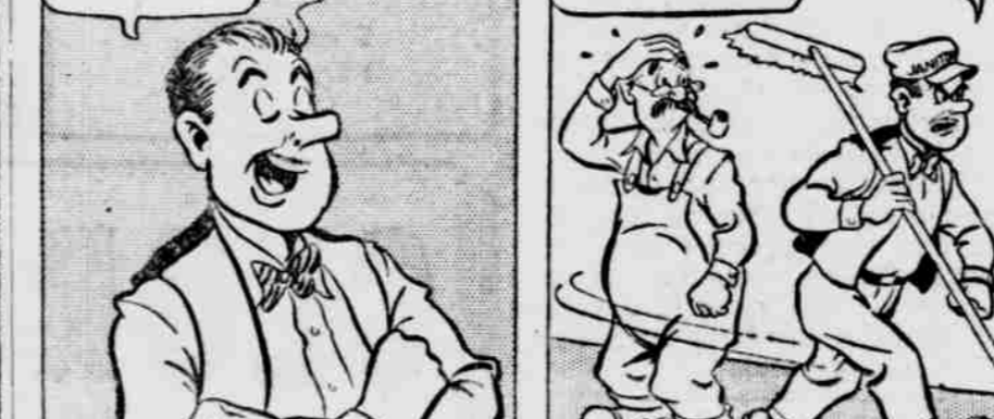
BOSS'S ORDERS - I'M TAKIN' YOUR PLACE FOR TWO WEEKS!