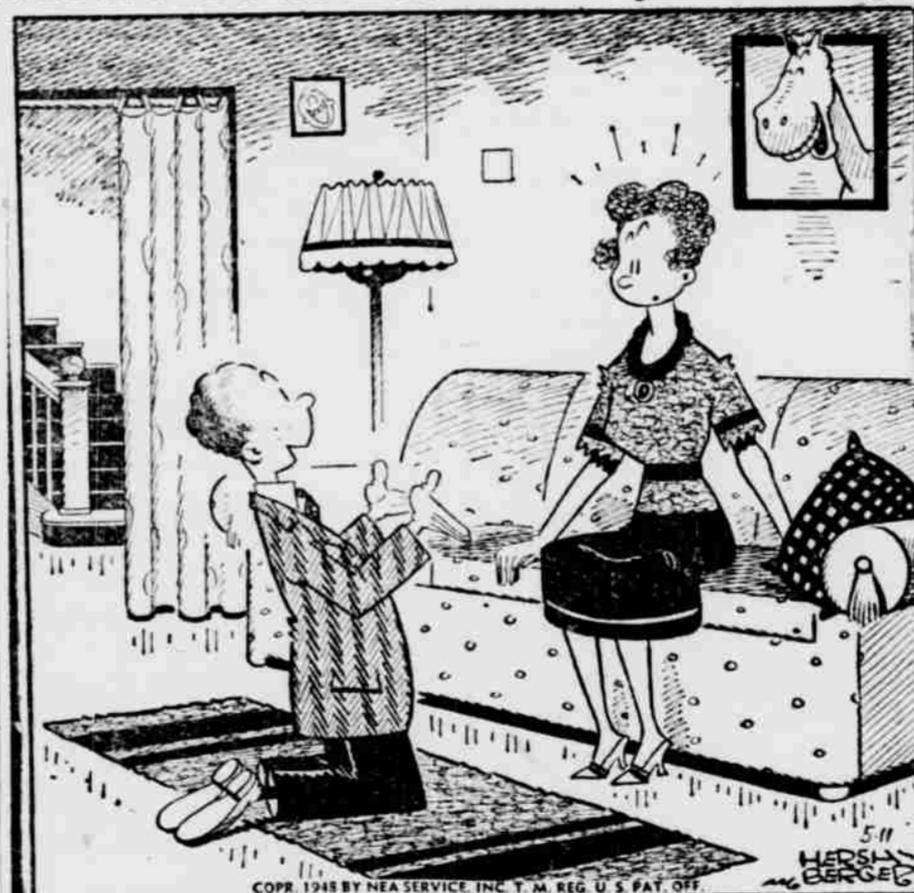
"What if you can't cook? I haven't enough income to buy groceries anyway!"