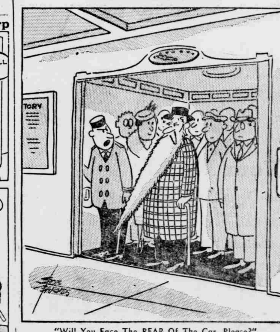
"Will You Face The REAR Of The Car, Please?"