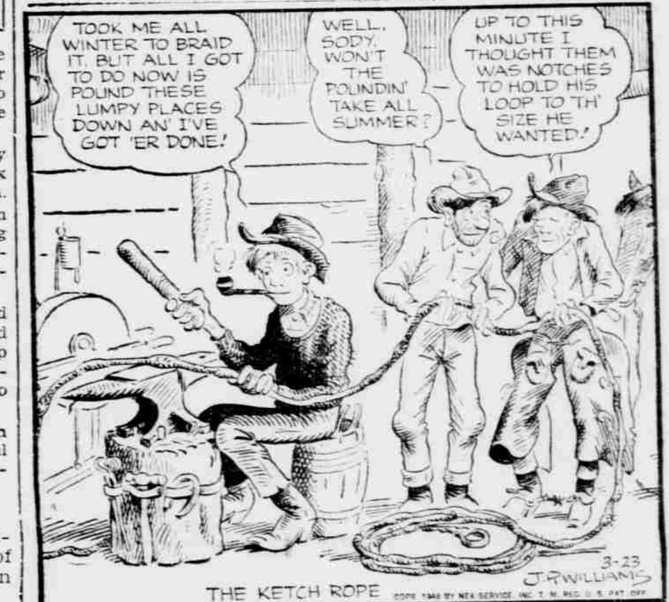
THE KETCH ROPE