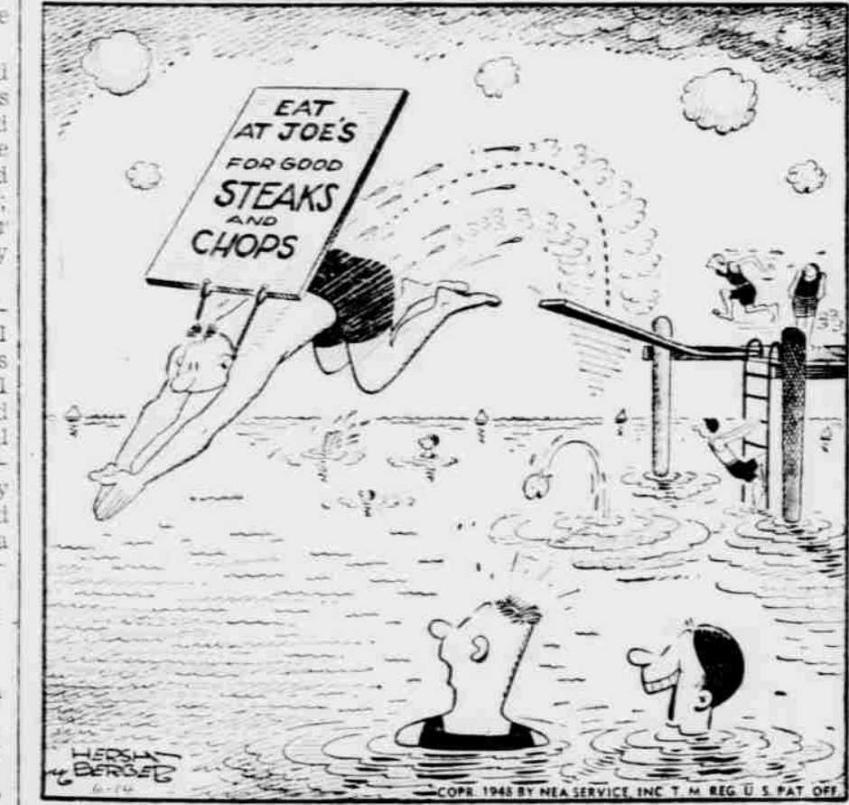
"He doesn't like to take any time off from his work!"