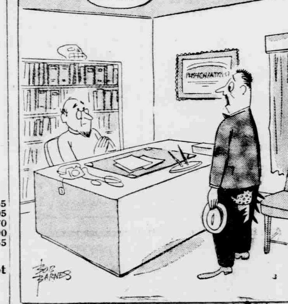
"I'm afraid of dogs, Doctor."