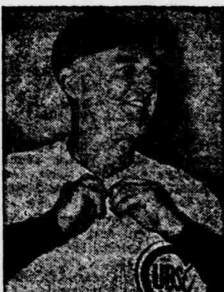
FRISCH CLUB... Frankie Frisch, newly appointed manager of the Chicago Cubs, buttons his shirt in dressing room at Wrigley Field. Frisch succeeds Charley Grimm, who became a club vice-president in the Wrigley organization.