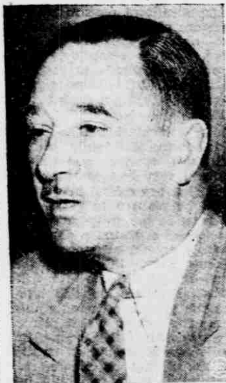
Harold E. Talbot, New York and Dayton, Ohio, industrialist, is the new chairman of the Republican national finance committee. He served as Governor Dewey's finance chairman before the GOP convention.