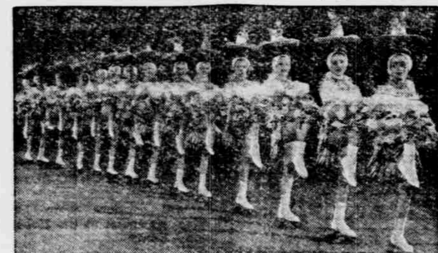
"Braziliana"—a beautiful production number done in wondrous black-light.

The most elaborate production ever seen in Omaha—the ALL NEW sixth edition of "SKATING VANITIES OF 1948"—makes its third appearance at Ak-Sar-Ben Coliseum, Nov. 4th through Nov. 9th, with a Sunday matinee on Nov. 9th.