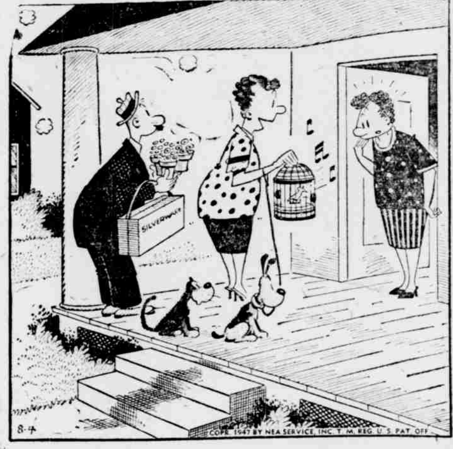
"Would you mind doing us a favor while we're on vacation?"

CANADA: No waiting list figures available. No official estimate of number of, inquiries. portation is limited and crowded, and farming.