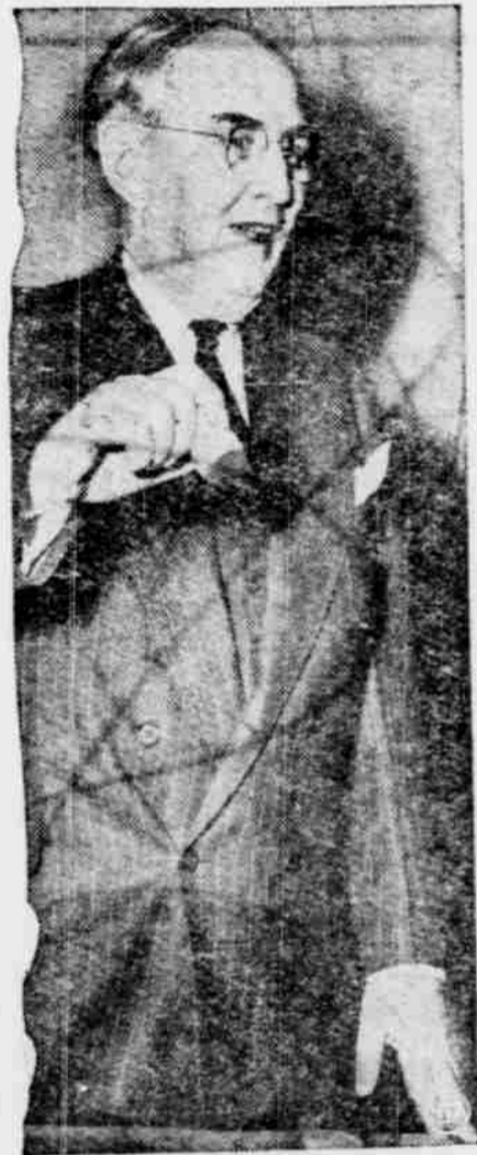
Sen. Arthur Vandenberg of Michigan demonstrates technique with gavel on Senate rostrum. He is the new president pro tempore and presiding officer.

Some food heats the blood, a doctor observes. And sometimes the price of it makes the blood boil.