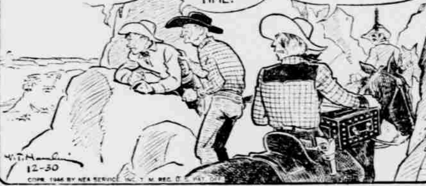
KNOW SHERIFF, THEM / YEH, BUT NOT CLEVER OLITLAWS ARE CLEVER ... (ENOUGH ... SPLIT UP AND THEY AIN'T LEFT A WORK THE STREAMS TRAIL SIGN FOR HOURS THEY GOTTA HIT GRIT SOMETIME

WE BETTER GET A SUMPIN'S RAISIN' ) COULD BE MOVE ON ... THAT GORY DUST ... I THINK WE BY GADFRY GULCH SHERIFF'S A THEY DIDN'T GOT A POSSE ON TOUGH CUSTOMER OUR TRAIL LOSE MUCH TIME!