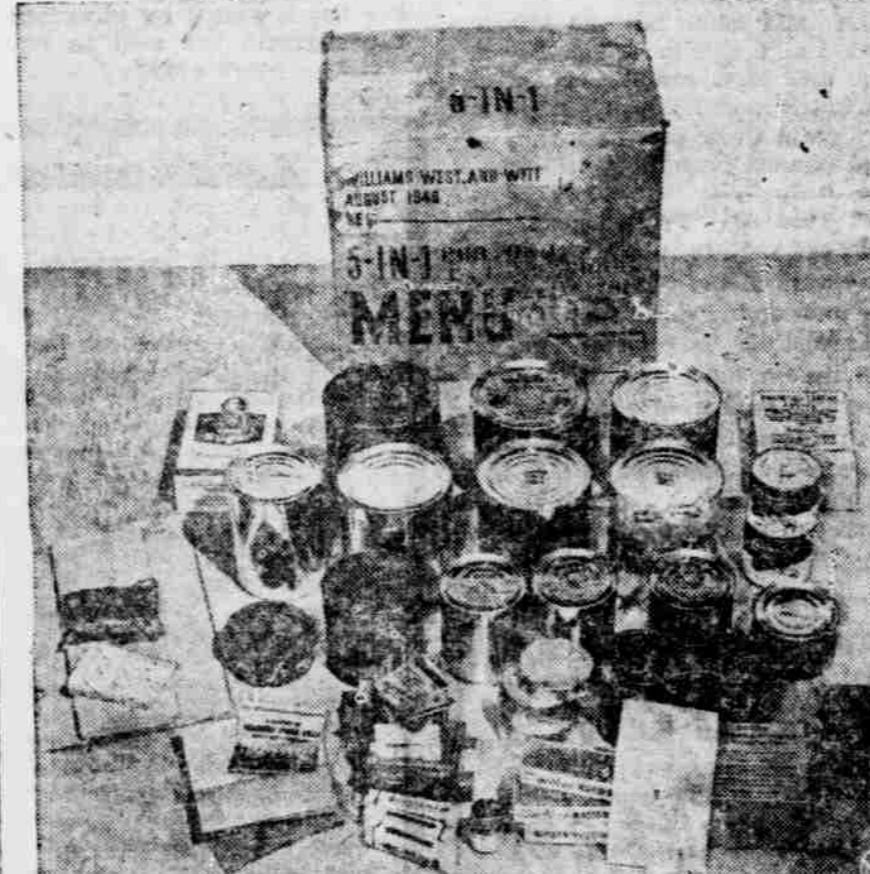
Small groups of soldiers separated from their kitchens henceforth will "dine" on the Army's new "5-in-1" ration pictured above.