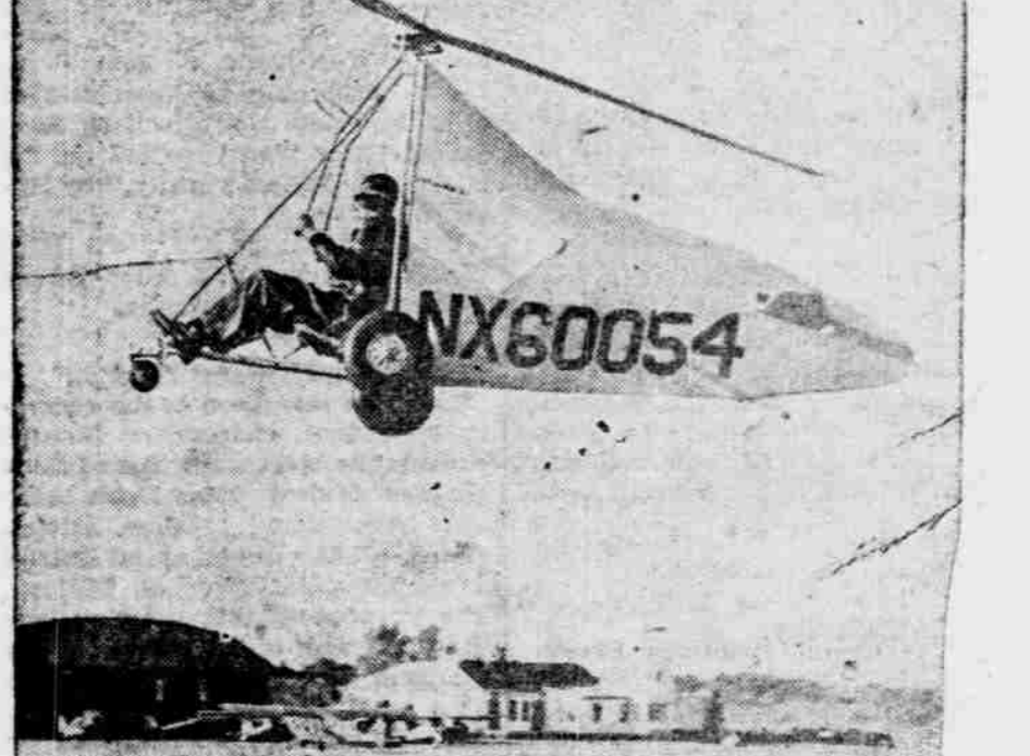
Queer-looking craft above is a new wingless glider, known as the G-E Gyro-Glider, pictured during recent test run, towed by a jeep at Schenectady, N. Y.