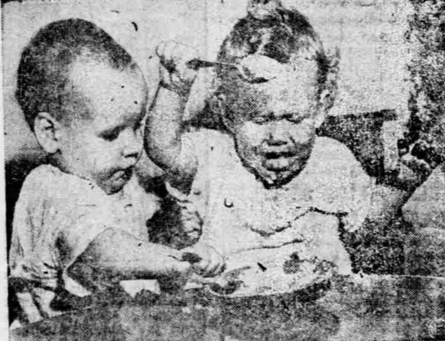
Any parents with two or more youngsters will quickly recognize the scene above. The little lady at right sets up a lusty howl as her companion tries to chisel in on her breakfast dish.