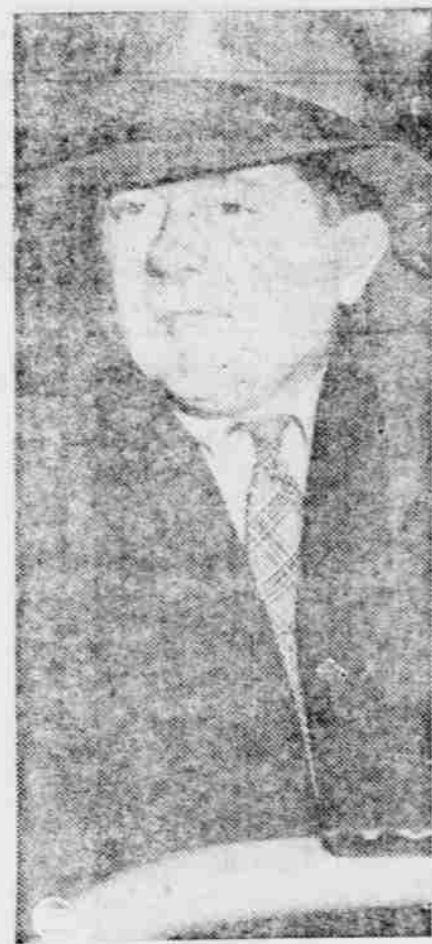
Owner Tom Yawkey appears to be figuring it out from ringside seat at World Series. Most people believed man of many millions had right answer in Red Sox.

Britain said it believed the most suitable agency would be the proposed international trade organization now being set up in London.