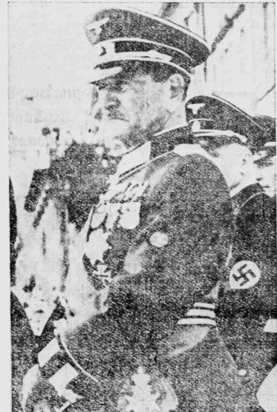
NAME USED ON MUNICH RADIO.—General Ritter von Epp, high Nazi and German Army official, whose name was used by a voice on the Munich radio station heard appealing to the Allies to hurry aid to the city, reported center of German patriot revolution.