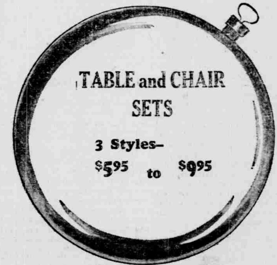
TABLE and CHAIR SETS