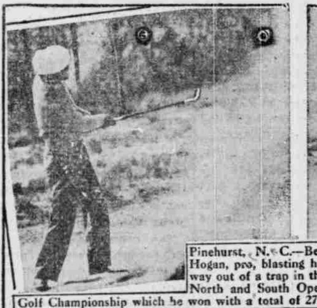
Pinehurst, N. C.—Ben Hogan, pro, blasting his way out of a trap in the North and South Open Golf Championship which he won with a total of 277.