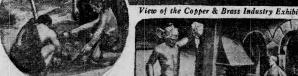
Copper was discovered by a half savage tribe

Among the many interesting exhibits which will feature the New York World's Fair when it opens May 11th will be that of the Copper & Brass Industry. It will be housed in the Hall of Industry. The story of copper from its discovery by a half savage tribe on the Island of Cyprus on down through the flight of centuries to its present day uses will be graphically shown by animated dioramas and displays showing the many uses of the oldest metal of commerce.