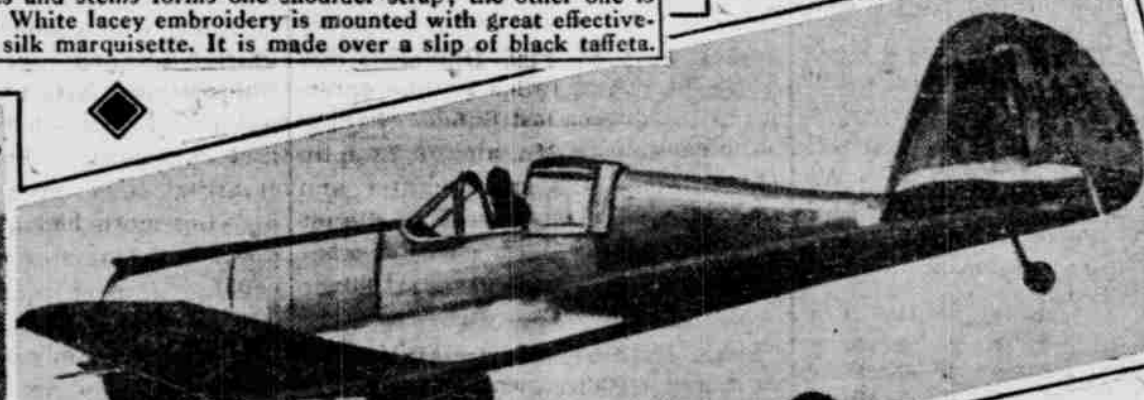
CLIMBS A MILE-A-MINUTE —St. Louis, Mo.—One of the new Interceptor Fighters in a test flight. The plane is designed to attack invading enemy bombers between the time the alarm is sounded and before they reach their objective.