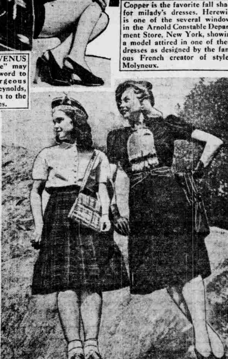
SHORT CUTS TO CHIC—New York City—The younger girl (left) is wearing a Scotch ribbon hat and shoulder strap bag to match. Big sister has dressed up her basic daytime frock with a fringed scarf, hat, and belt made of two shades of belting ribbon.