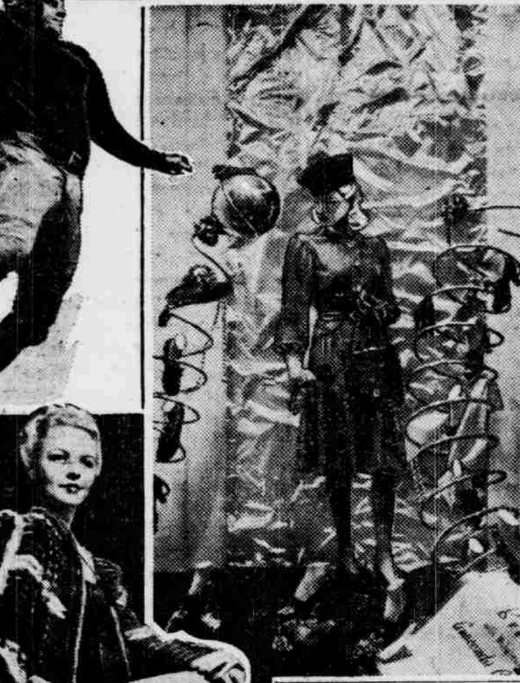
Copper is the favorite fall shade for milady's dresses. Herewith is one of the several windows in the Arnold Constable Department Store, New York, showing a model attired in one of these dresses as designed by the famous French creator of styles, Molyneux.