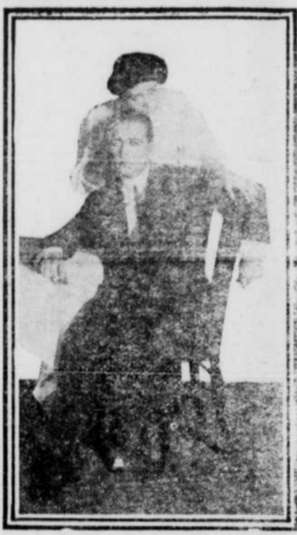
Scene from the Third Degree at Gehling's Theater Mch. 28

The Old Reliable Jeweler & Optician Opposite Post-Office