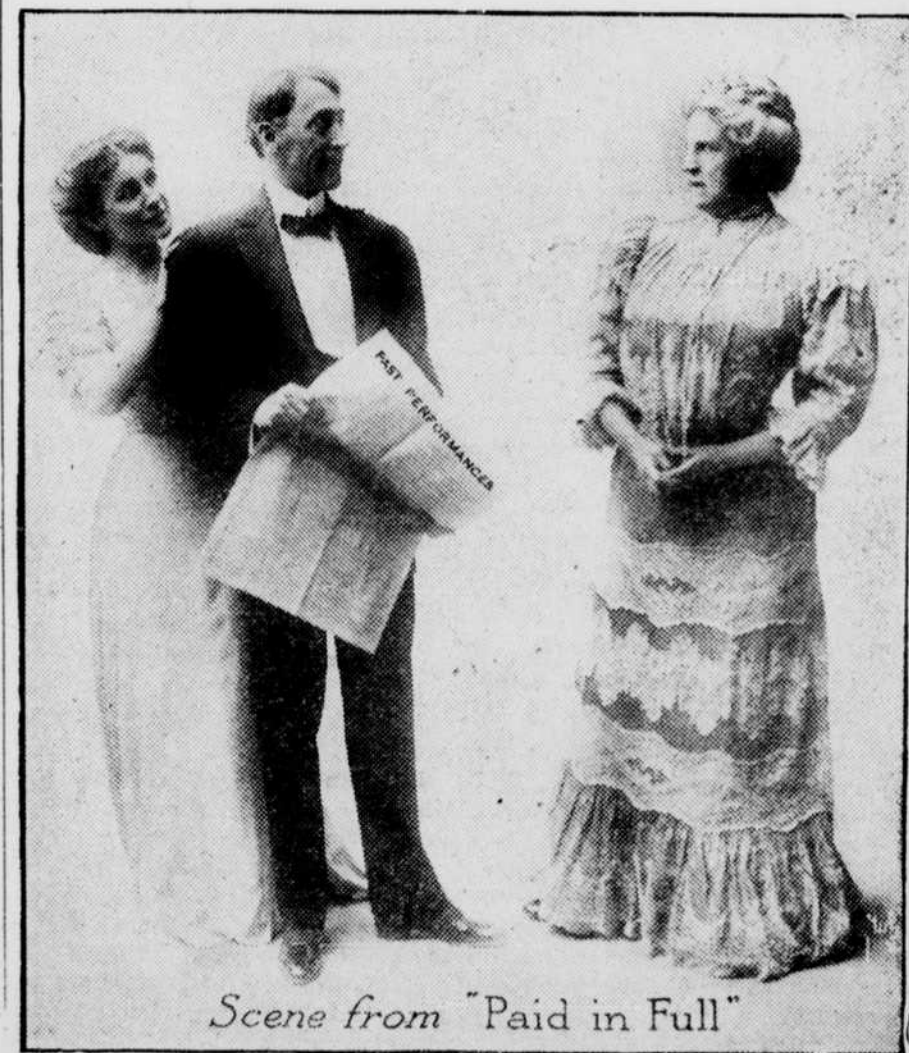
Scene from "Paid in Full"