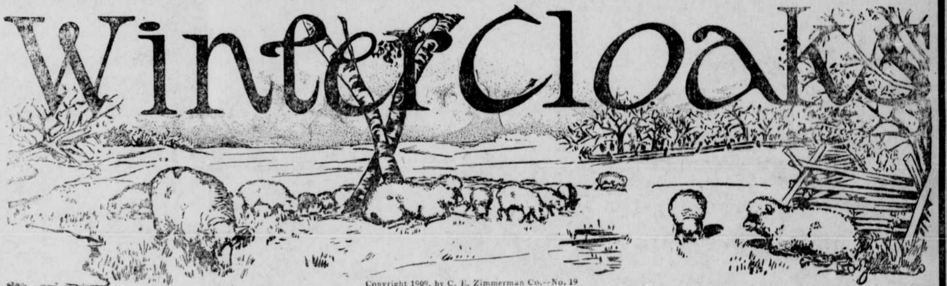
Copyright 1909, by C. E. Zimmerman Co.--No. 19

Every Ladies Cloak or Suit in the House One-third Off