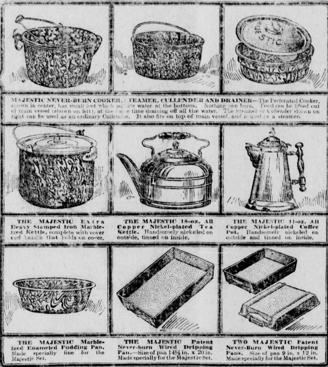
MAJESTIC NEVER-BURN COOKER, TEAPOT, CULLENDER AND DRAINER —The Perforated Cooker, shown in center, has small feet which allow water at the bottom. Nothing can burn. Food can be lifted out of main vessel (shown on left) at the same time draining off all the water. The steamer or culleander shown on right can be used as an ordinary culleander. It also fits on top of main vessel, and is used as a steamer.

THE GREAT AND GRAND MAJESTIC RANGE THE RANGE WITH A REPUTATION MADE IN ALL SIZES AND STYLES.