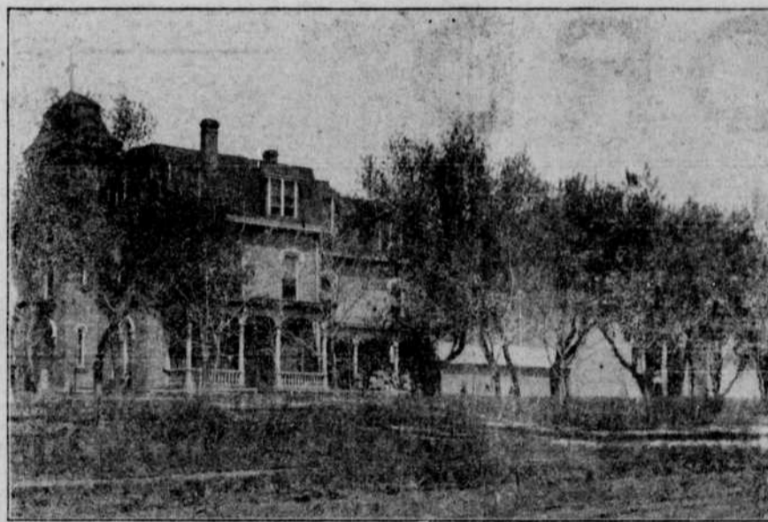
The Catholic Convent.