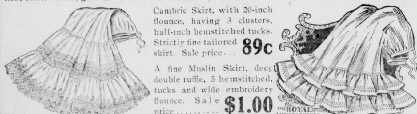
A most enticing range of Muslin Petticoats at $1.25, $1.50, $1.75, $2, $2.50, $3 and up to $6.50

Muslin Skirt, wide flounce, lace insertion, cluster tucks, good muslin, this sale 50c Muslin Skirt, a better quality; wide flounce, two clusters of tucks... 60c Cambric Skirt, with 20-inch flounce, having 3 clusters, half-inch hemstitched tucks. Strictly fine tailored skirt. Sale price... 89c A fine Muslin Skirt, deer double ruffle, 5 hemstitched, tucks and wide embroidery flounce. Sale price... $1.00