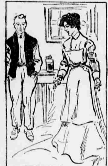
"I Don't Like Them."

There was a heavy frown on Matilda's face and her stern silence was ominous. Her brother and his two children felt her mood and ate breakfast quietly without speaking. All the sunshine and cheer of out-of-doors were shadowed by the clouds within.