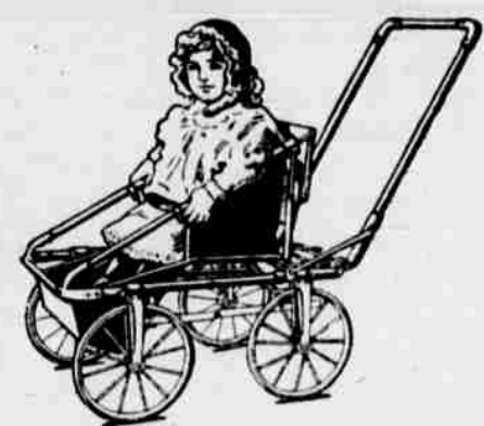
UPRIGHT, IN USE.