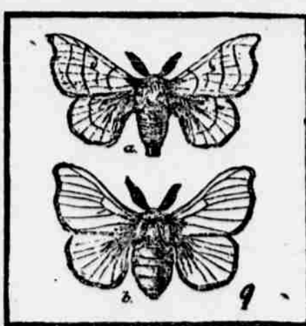
MOTH AFTER COMING OUT OCCOON

Is America to become a great, if not the greatest, silk producing country in the world? Judging from recent successes in Georgia and still greater ones in New York state within twenty-five miles of New York city, the