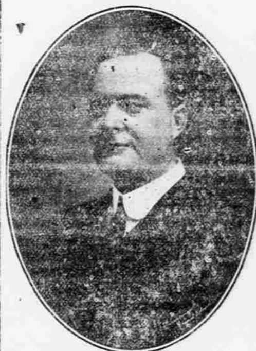
SILAS R. BARTON, Republican Candidate for congress, 5th Congressional District, primaries April 19th.

It is one of these smart little dresses that close at the sidefront collar, rounded off jauntily in front, is in deep oval style at the back; the sleeves are of the most approved set-in variety; the skirt is five-gored; and the waist is turned back in single revers effect, giving an appearance of being designed to button over, and at the same time forming a pointed section that effectively brings the smart little waist into harmony with the clever new skirt design.