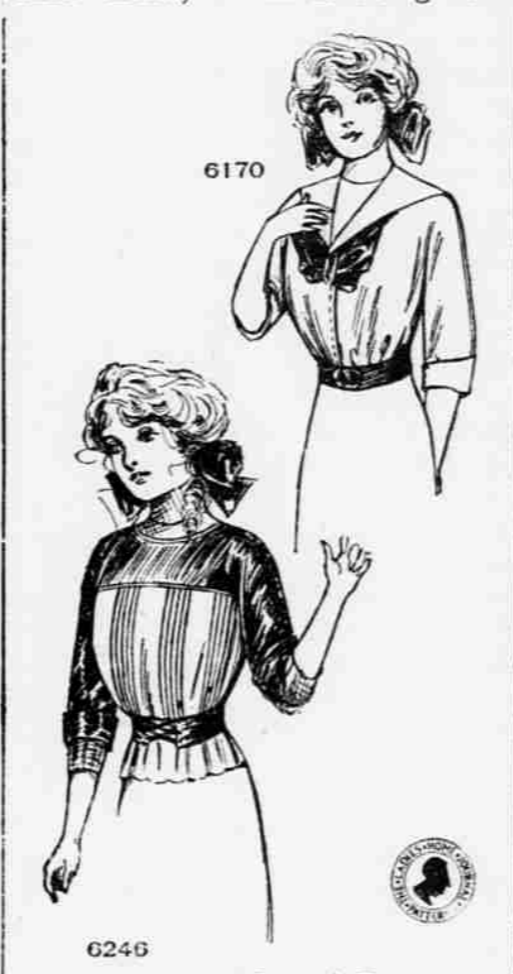
Ladies' Home Journal Patterns

With the tailored suit, a blouse of matching chiffon, crepe meteor, satin or messaline, is absolutely essential, simple of line for morning and general wear, more elaborate for afternoons. For the young girls, the practical sailor blouse is always in style, and this season, it is developed in fine cashmeres, corduroy, satin or wash silk, in the fashionable peasant style. The collar may be of self-material, or of some contrasting fabric in self color white cashmere, and corduroy, with satin collar are decidedly smart. The other blouse displays the much talked of Citoyenne effect, which is being fea-