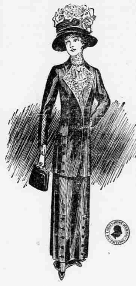
Ladies' Home Journal Patterns Nos. 5687 and 5688

Most women are preparing for cooler weather and planning thei new fall suits. There is usually a feeling of satisfaction when one gets into a trim fall suit after the soft light dresses of the summer. A fine serge is always a practical material for general use, especially in dark shades of blue. The shops still show large revers on