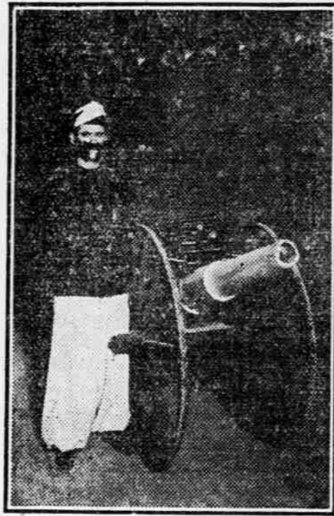
A ROYAL ARTILLERYMAN.

flavor injected into the name. The Syrian Ak, meaning head of the family; Sar, Arabic, the household, and Ben, Hebrew, meaning brothers in the household, combine to give the true meaning of the organization, the king, the body of knights, and the household—in short, all.