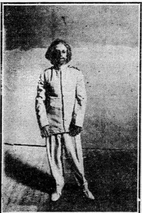
THE IMPERIAL BANDMASTER.

Every loyal son of Nebraska heartily indorses the sentiment, "Sweet are the uses of adversity," for out of this grew the Ak-Sar-Ben. If the wave of hard times and trade depressions had not swept over the state in the early '90s; if there had not been the resulting depleted values in real estate and tightness of money, there might have never been an Ak-Sar-Ben to enjoy in these days of prosperity. For Ak-Sar-Ben is the development of the deliberations of a sturdy band of men, who early in the spring of 1895 looked conditions squarely in the face, and met them with true western spirit by deciding that only some strenuous action could shake off the lethargy that