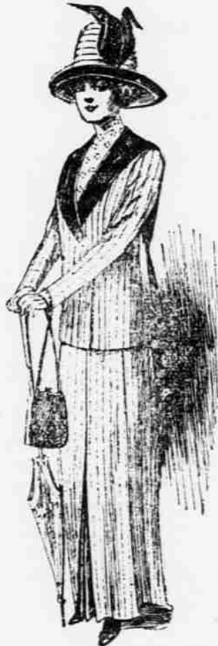
Ladies' Home Journal Pattern No. 6218-6233.

The suits for dressy wear have the coats quite short and are made of both plain and fancy velvets, satins and satine. In the