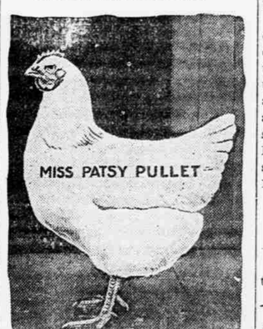
MISS PATSY PULLET I'm now a chicken fat and fine, And since their Lenten fast My owners will expect to dine— I real feed at last— And in a stew I'm sure to be When I am carved for fricassee.