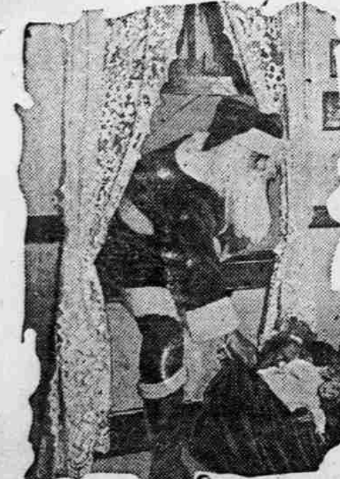
And WISE ONES Surely Won't Delay Christmas Shopping Another founding of the first permanent mu-_ Day