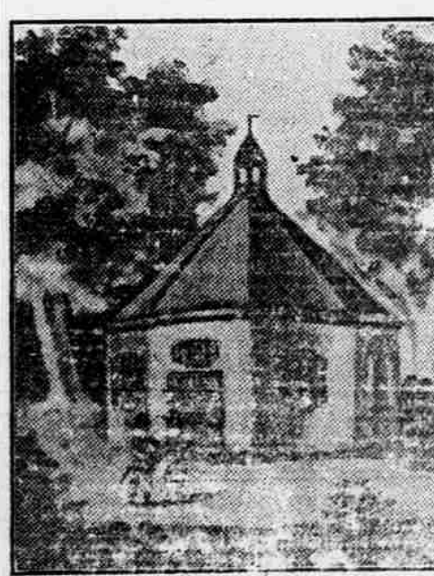
NEW JERSEY'S FIRST CHURCH.

Two hundred and fifty years ago a handful of Dutch settlers established themselves in a little stockaded village