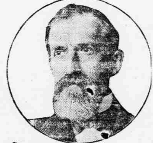
JOHN W. KERN.